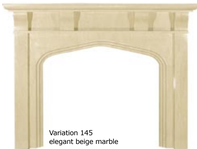
Variation 145 elegant beige marble